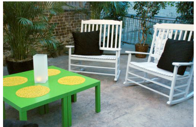
Park benches - white rockers (black metal and wood also available.)