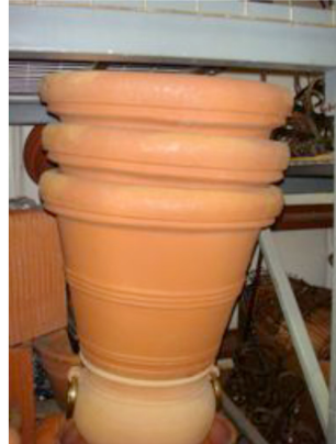
Faux terra cotta