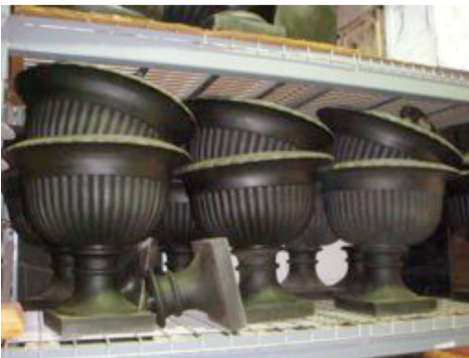
Pedestal Urns, available in black, white, and tan (pedestal shown above)