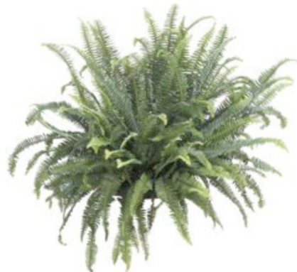
Kimberly Queen Fern