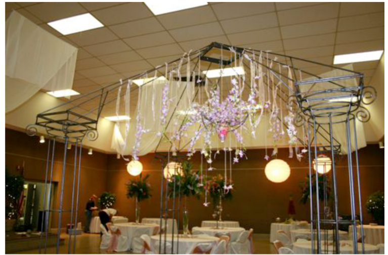
Metal gazebo - pewter (flowers and garland available for and additional fee)