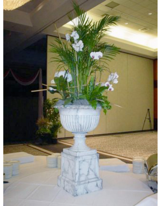
Areca Palm in pedestal urn with orchids