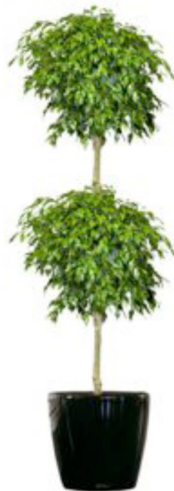
Two Ball Ficus