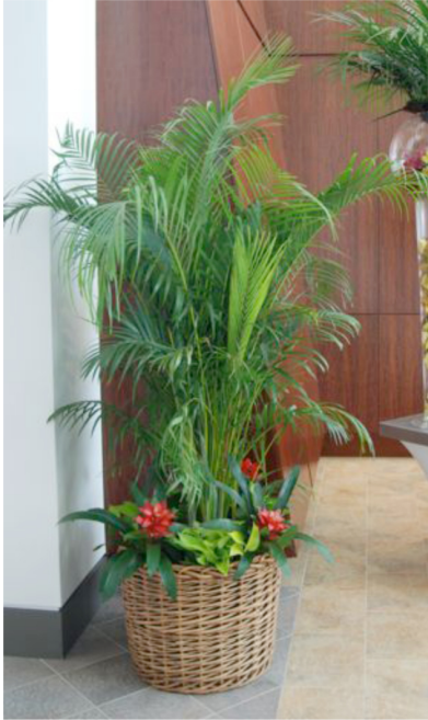
Areca Palm with underplants