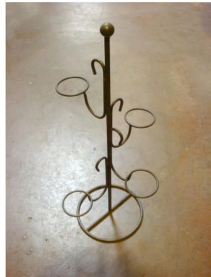
3-4-10-12 spiral votive holders (rust and pewter)