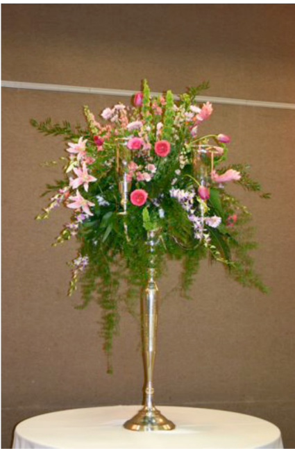
Sterling silver candelabra with glass hurricanes (flowers available for an additional fee)