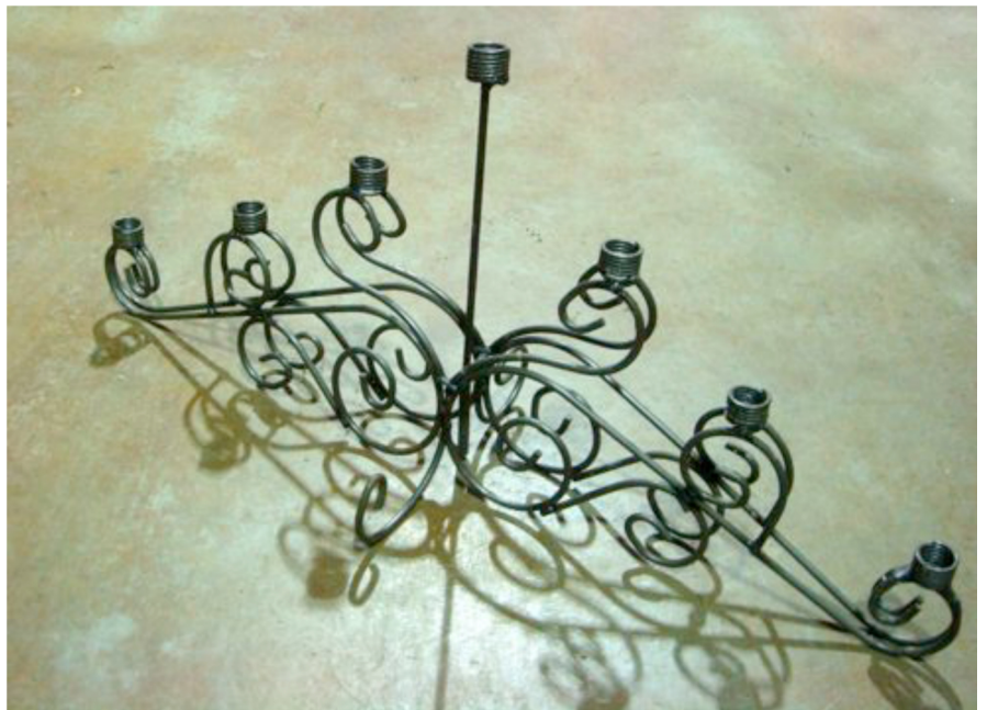
Pewter 7 candle "A-frame" candle holder (for table top or stand)