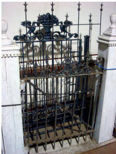
Iron Garden Gates