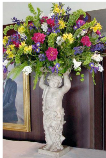
Cherub boy planter (flowers available for an additional fee)