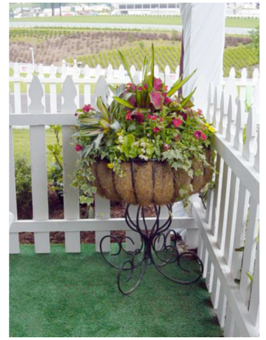
48" tall wire basket (flowers avail. for an addtl. charge)