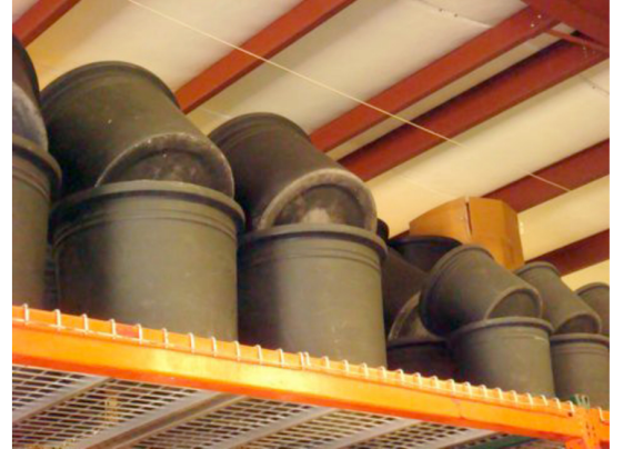
Matte Black Container with lip