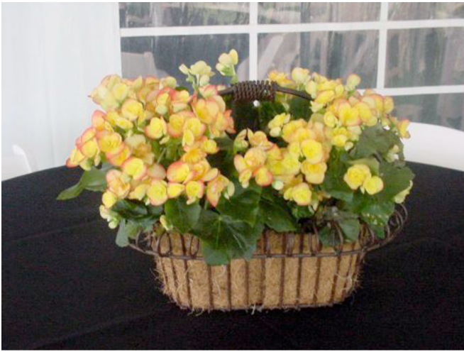
French basket with handle (flowers available for an additional charge)