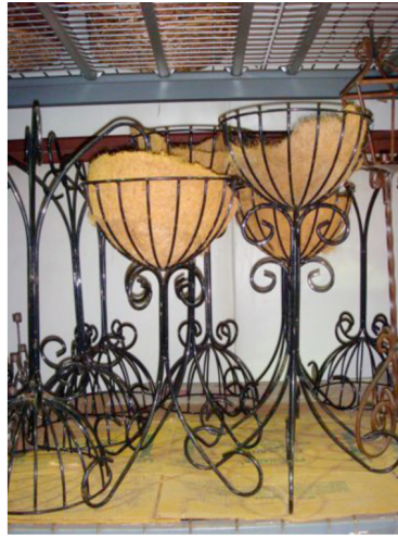
24", 30" and 36" tall wire basket