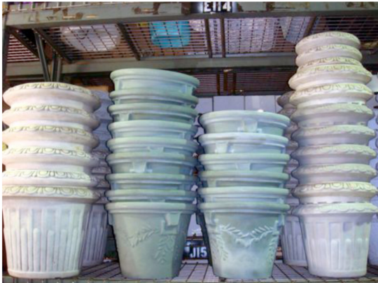
Faux concrete planters