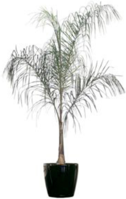
Cocous Plumosa Palm