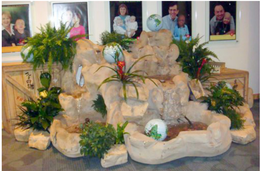
Large faux rock fountain