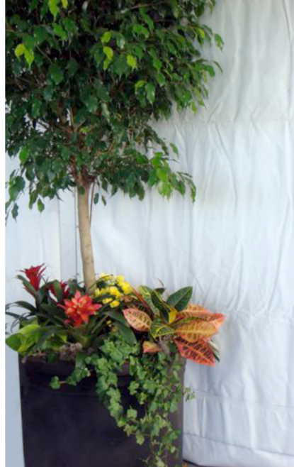
Ficus with underplants