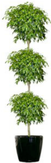
Three Ball Ficus