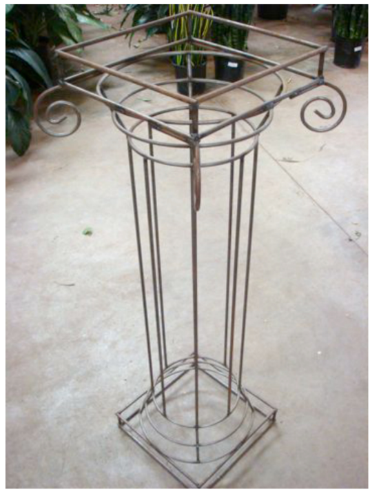
Pewter metal columns