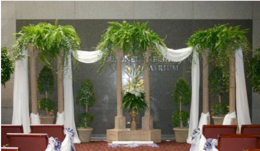
Roman Columns - Set of Three (draping, plants and flowers available for an additional fee)