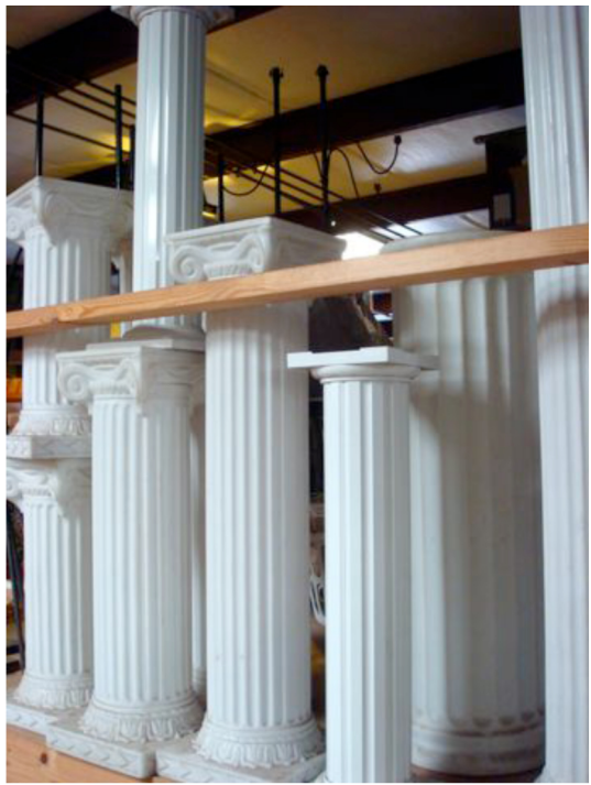
White Grecian columns