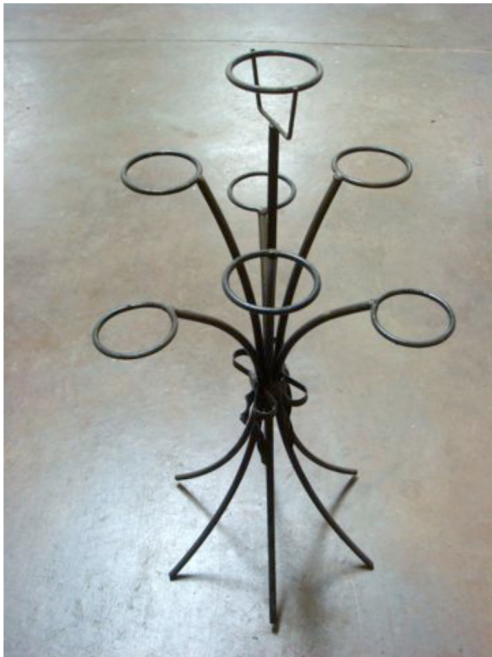
Seven candle table top holder